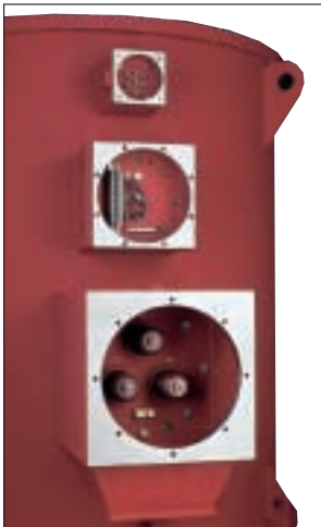
Main and auxiliary terminal boxes Exd IIC