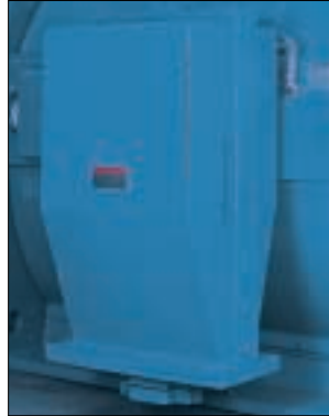
Standard 10 kV terminal box