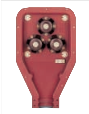
Standard terminal box with 6 kV cast-resin bushings