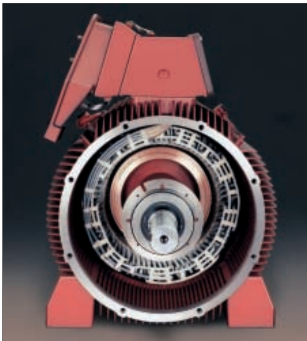
Connecting side of endwinding