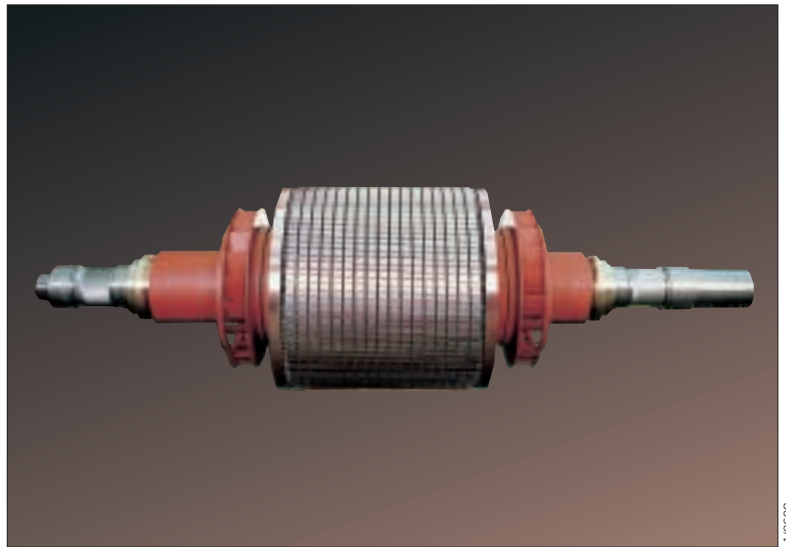
Rotor with copper cage winding

For higher starting torques, or to meet the requirements of particular torque characteristics, special slot designs can be used.