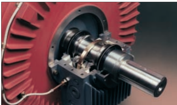
Self-lubricated sleeve bearing