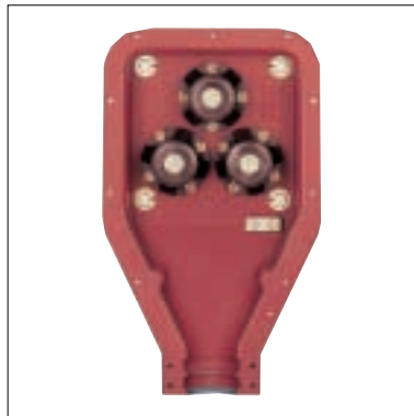
Terminal box with 6 kV cast-resin bushings