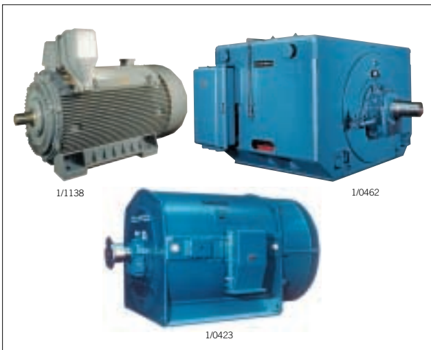
Different terminal box designs

200/350/400 MVA up to 6.6 kV or 330/800 MVA up to 11 kV