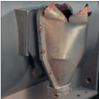
Standard 6 kV terminal box with opened relief joint