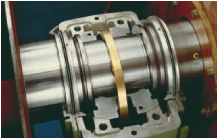
Sleeve bearing with ring oiler