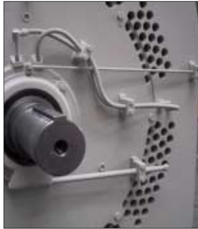
Antifriction bearing with lubricator and grease drain

Lubricators and grease slingers ensure proper lubrication of the bearings. The outer bearing covers are provided with a space for old grease and a grease drain.